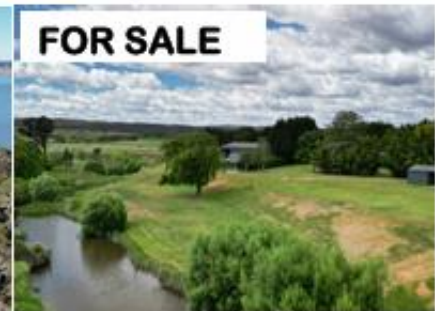
45 Middle Street SUTTON

We have been selling properties in the area for many years now & our clients are very happy with the prices we have achieved. We also do free pre-sale inspections & can suggest ideas & options to improve the marketing of your property. We will do all we can to obtain the absolute best result for you in the timeline that suits you. So please don't be talked into selling for less as it is not fair to yourselves or your family & it affects all the future valuations for the area.