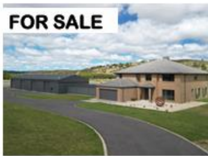
10 Lumley Road WAMBOIN

We work 7 days a week and can come at anytime that suits your schedule.