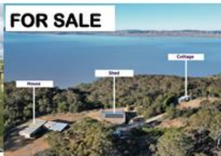
525 Grove Road BYWONG